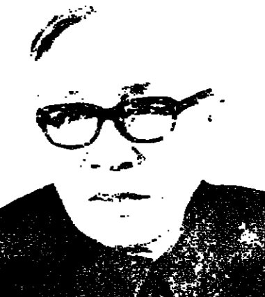
LE DUC THO